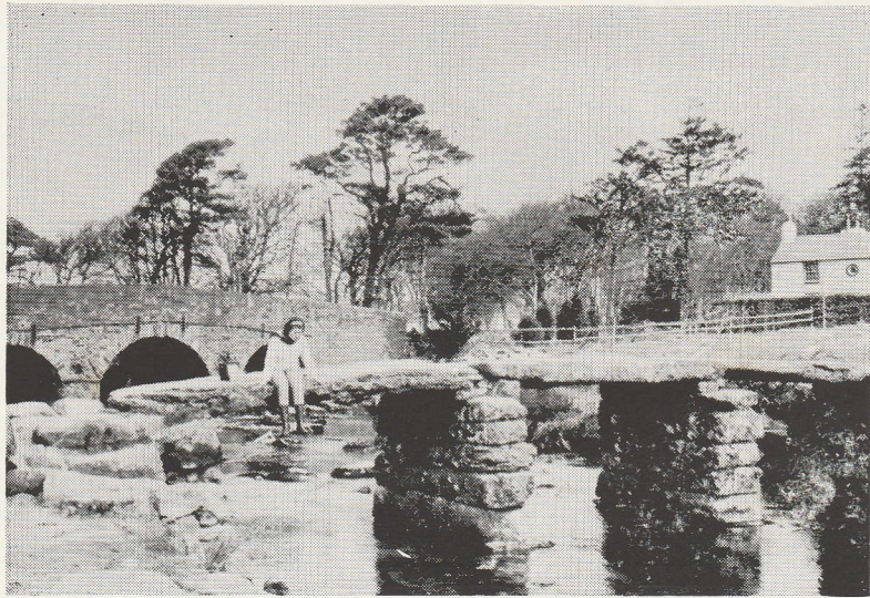
The Old and the New, bridges on the East Dart River, near Dartmouth.