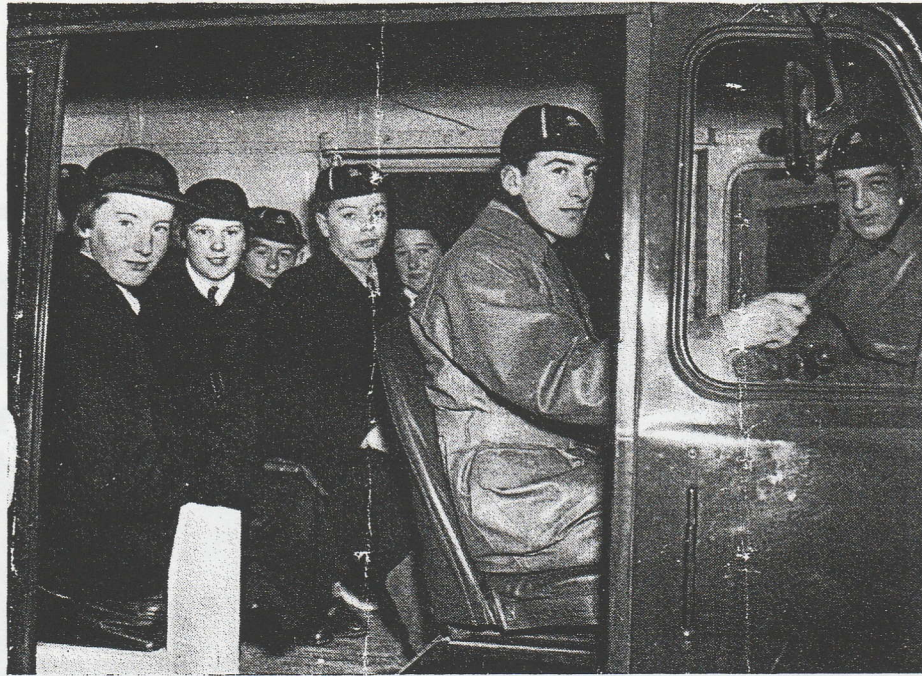
All boarders at the age of 17 are taught to drive. When fully qualified and after some experience they are allowed to drive the school motor transport.