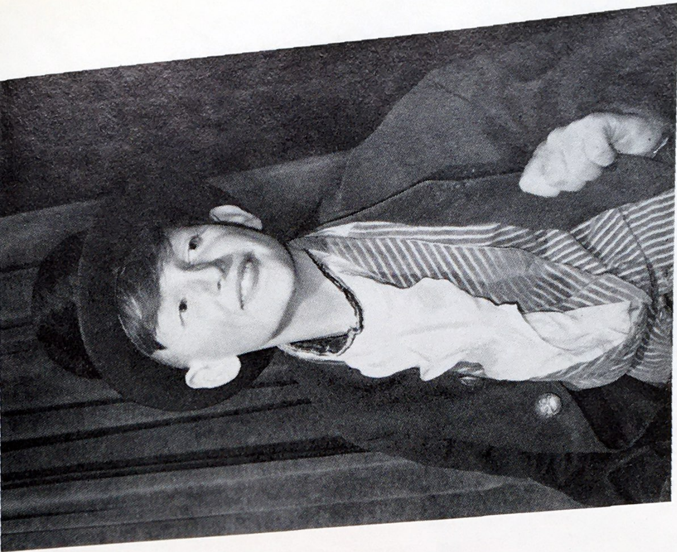
THE ARTFUL DODGER